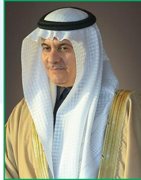
Abdulrahman Abdulmohsen A. AlFadley Minister of Environment, Water and Agriculture

Kingdom of Saudi Arabia المملكة العربية السعودية